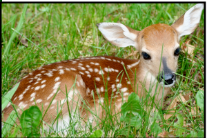
Fawn resting in grass.

Also known as the orange tailed deer or Virginia deer, the whitetail is native to the United States, Canada, Central America and northern South America. They are most common east of the Rocky Mountains, and are absent from the far western states. The white-tailed deer is a reddish brown color in the spring and summer that fades to a grayish brown in the fall and winter months. The size of the deer vary greatly, following Bergmann's rule that the average size increases the farther away from the Equator the animal lives. Bucks can vary from 130 lbs to an excess of 350, while an adult doe in the tropics or Florida Keys can be found as small as 60 lbs, to over 200 lbs in northern climates. The average shoulder height is 21" - 47".