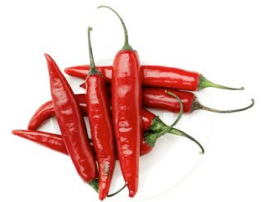
Chili de Arbol