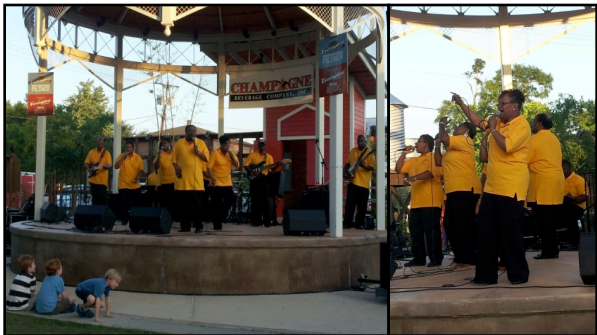
The Dynamic Smooth Family Gospel Singers

Rockin' the Rails is a free concert series held annually every Thursday in April and October at the Covington Trailhead, from 5 p.m. to 7:30 p.m. The first Rockin' the Rails concert of the year was last Thursday with "The Dynamic Smooth Family Gospel Singers". The lively and entertaining group performs at events ranging from charitable fundraisers to Jazz Fest, and they present an uplifting chorus of classic gospel music. Rockin' the Rails is hosted by the City of Covington and sponsored in part by Champagne Beverage and Covington Brewhouse.