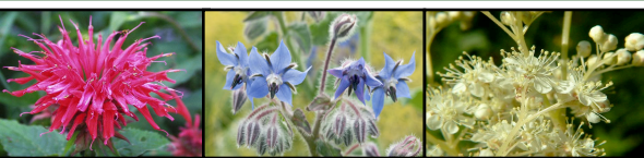
L-R: Bee Balm, Borage and Meadowsweet