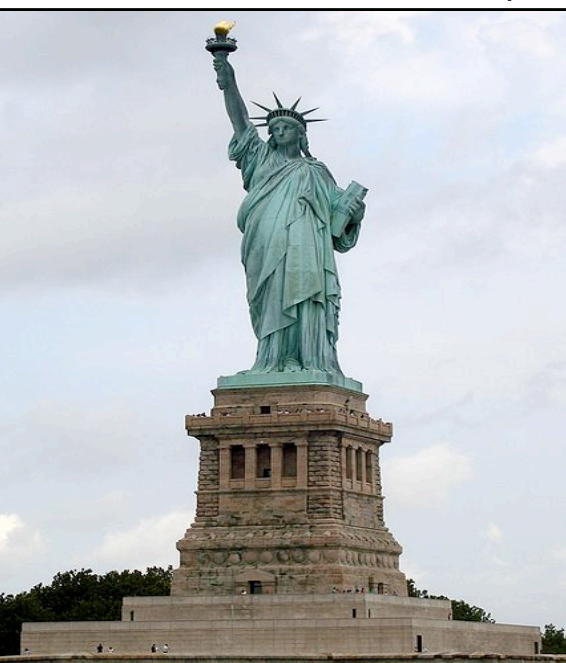
STATUE OF LIBERTY NEW YORK, NEW YORK

FOOD BANK covington Food - Health - Hope