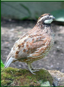
A male of the species.

Also called the Virginia Quail or Bobwhite Quail, the Northern Bobwhite is a member of the group commonly referred to as the New World quails, Odontophoridae. Native to the United States, Mexico and the Caribbean, the 22 subspecies of the Northern Bobwhite are also common game birds. In Louisiana, bobwhite quail populations have declined about 75% since 1966, according to the North American Breeding Bird Survey (2010). This is primarily attributed to an increase in habitat loss occurring during the 1970s and '80s, but their populations have begun to stabilize with conservation efforts. The Northern Bobwhite is a moderately-sized quail, the smallest galliform native to Eastern North America. The birds are a chunky, round shape, with an overall rufous plumage spotted by highlights of gray on the back and white on the stomach. The males have a white throat and a black chin strap, females are duller colored overall without a chin strap. Bobwhites eat mainly plants and small pest bugs. The birds are named for their distinct whistle, a clear "bob-WHITE" or "bob-bob-WHITE" that rises in pitch a full octave from beginning to end.