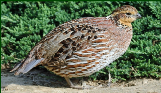
A female of the species.

Also called the Virginia Quail or Bobwhite Quail, the Northern Bobwhite is a member of the group commonly referred to as the New World quails, Odontophoridae. Native to the United States, Mexico and the Caribbean, the 22 subspecies of the Northern Bobwhite are also common game birds. In Louisiana, bobwhite quail populations have declined about 75% since 1966, according to the North American Breeding Bird Survey (2010). This is primarily attributed to an increase in habitat loss occurring during the 1970s and '80s, but their populations have begun to stabilize with conservation efforts. The Northern Bobwhite is a moderately-sized quail, the smallest galliform native to Eastern North America. The birds are a chunky, round shape, with an overall rufous plumage spotted by highlights of gray on the back and white on the stomach. The males have a white throat and a black chin strap, females are duller colored overall without a chin strap. Bobwhites eat mainly plants and small pest bugs. The birds are named for their distinct whistle, a clear "bob-WHITE" or "bob-bob-WHITE" that rises in pitch a full octave from beginning to end.