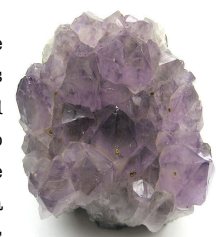
Macro of Amethyst Quartz

The Amethyst is the birthstone of February. The name comes from ancient Greek, a- (not) and methustos (intoxicated), due to the idea that the stone prevented intoxication. It is a variety of quartz that gets its violet color from trace minerals, irradiation and iron impurities.