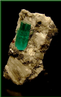
Emerald from Muzo, Columbia

The Gachala Emerald weighs in at 858 carats. Found in 1967 in Gachala, Columbia, it is housed at the National Museum of Natural History in Washington, D.C.