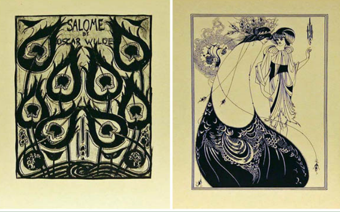
Aubrey Beardsley was an Art Nouveau-era illustrator who contributed the artwork for Oscar Wilde's 'Salome', which premiered in Paris in 1896.

For more details, visit www.sttammanyartassociation.org. Schools or community groups interested in touring the exhibit can contact the St. Tammany Art Association at (985)892-8650 or by email at info@sttammanyartassociation.org.