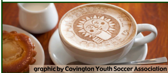
graphic by Covington Youth Soccer Association

National Coffee Day is Sunday, September 29th. There are many local coffee distributors in our area, and Covington is graced with our own local coffee roaster as well! Select beans are roasted fresh each morning at Campbell's Coffee & Tea. Campbell's is closed on Sundays, so they will be celebrating National Coffee Day on Saturday, September 28th. Stop in anytime Saturday during business hours for FREE refills in your own Campbell's Coffee & Tea mug, cup or travel mug! Fresh roasted coffees are also available by the bag!