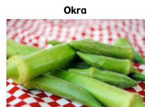
Slice of Heaven Farm