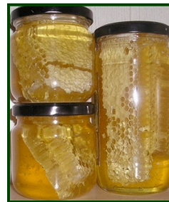
Raw Honey Combs

Honey has been used since ancient times both as a food and as a medicine. Apiculture, the practice of beekeeping to produce honey, dates back to at least 700 BC. Honey has incredible anti-bacterial, anti-viral and anti-fungal properties. It has been touted as an immune builder, most likely due to its content of friendly bacteria in its raw form, a blood sugar stabilizer (its nearly 1:1 ratio of fructose to glucose is much more tolerable to those with glucose intolerance) and an antioxidant. There have also been positive results with cancer patients using honey. Aloe vera is excellent for minor scrapes and burns, but for deeper lacerations it is suggested to use raw honey to "seal" the wound from the inside.