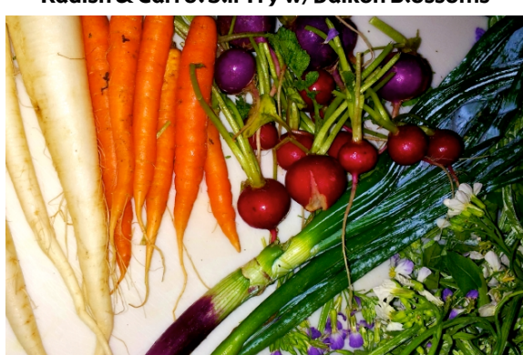
Veggies From Slice Of Heaven Farm

Radish & Carrot Stir Fry w/Daikon Blossoms