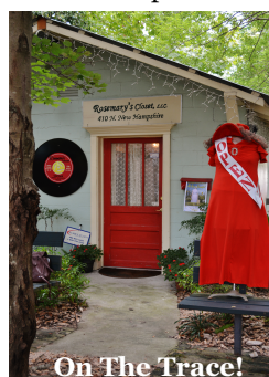
On The Trace!