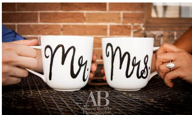
"Brewing Love" was submitted by Allison Badely Photography, taken in front of St. John's Coffeehouse on Columbia Street in Downtown Covington, LA.

Submit your photo to covweekly@mediaproductions.com for a chance to have it featured in our "Photo of the Week". Preference will be given to photos taken locally. Please include the title of your photo, the name of the photographer and where the photo was taken. Original works only, please.